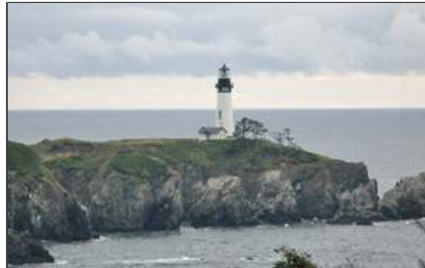
View of Lighthouse from Pacific Shores