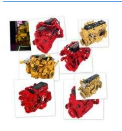
It Does Not Have to be Yellow!

Did you know that the person chosen to serve as the Club's first VP had a Detroit Diesel, not a Caterpillar?!